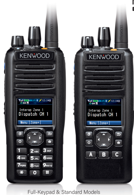
Full-Keypad & Standard Models

System consists of the Rapid Charger (KSC-Y32), and Battery Reader (KAS-12) software Up to 60 Rapid Chargers can be chain-connected to a PC installed with the KAS-12. KAS-12 Battery Reader software can display and manage information including battery type, model name, voltage, temperature, discharge cycle, expected life, and remaining capacity Up to 5,000 batteries can be managed at a time. (Requires an additional option)